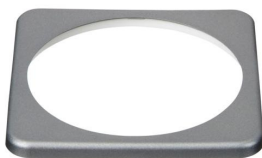
BMV bezel square