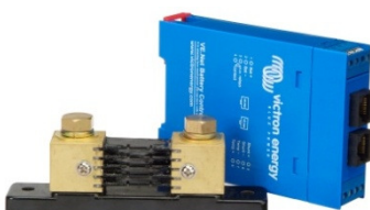
VE.Net Battery Controller

No prescaler needed. Note: RJ45 connectors are galvanically isolated from Controller and shunt.