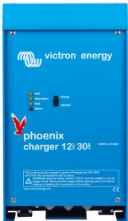
Phoenix charger 12V 30A