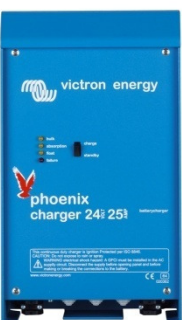
Phoenix charger 24V 25A

To learn more about batteries and charging batteries, please refer to our book 'Energy Unlimited' (available free of charge from Victron Energy and downloadable from www.victronenergy.com ). For more information about adaptive charging please look under Technical Information on our website.