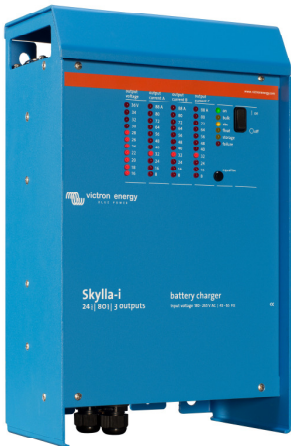
Skylla-i 24/100 (3)