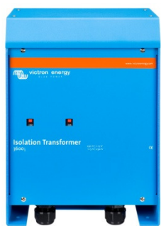
Isolation Transformer 3600W

Supply 185 – 250 V: switches to 230 V supply