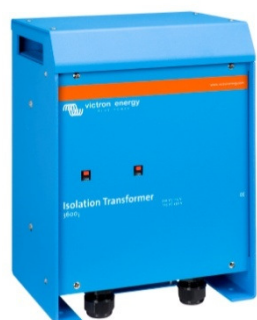
Isolation Transformer 3600W