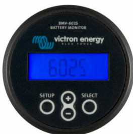
BMV 602S Black